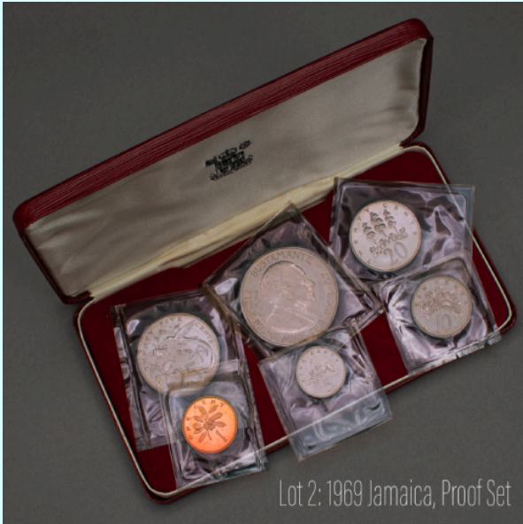
Lot 2: 1969 Jamaica, Proof Set