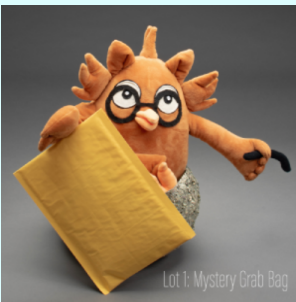
Lot 1: Mystery Grab Bag